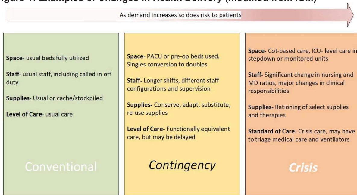
Figure 1: Examples of Changes in Health Delivery (modified from IOM)